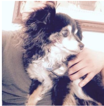
Lou: foxtails stuck in his face