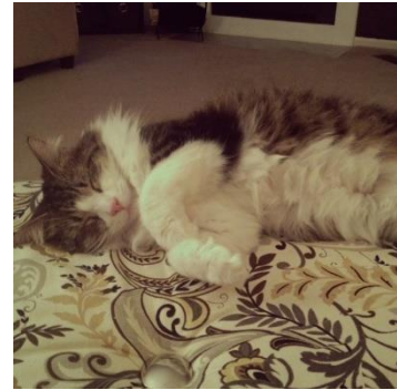
Lexi: full dental extractions