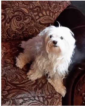
Sophie: bladder stones

Two older shepherds lost “their” home to foreclosure. Pet Assistance, Inc. stepped in when no other group would help them because of their ages. Thanks to PA, Facebook and Pet Finder, they are both making their new families VERY happy.